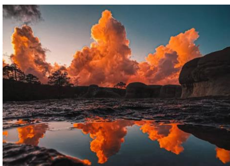
Experience the natural wonders of the Sierra Madre Occidental

Located in the Guadiana Valley, the "Villa de Durango" is part of the El Camino Real de Tierra Adentro (Royal Road of Inland), a World Heritage Site by UNESCO. Many of its imposing buildings are now museums and cultural centers where antiques, religious art and ethnographic collections reflect the customs and talent of indigenous cultures that originally settled in the region.