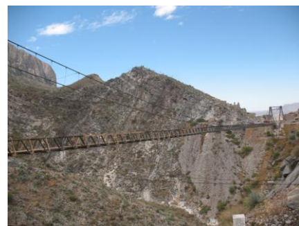
Cross the Ojuela Bridge