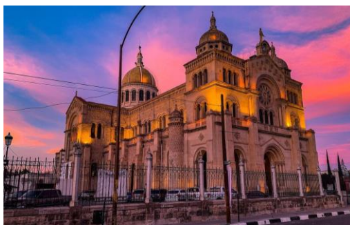
Explore the architecture in downtown Durango