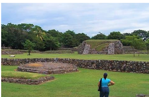
Explore El Chanal archaeological site

Known as the City of Palms, Colima, is a picturesque colonial town that lies between two volcanoes: the Fire volcano, the most active in Mexico, and the Frosted from Colima. Its magical town Comala, known as "the white town of the Americas" was immortalized by the Mexican writer Juan Rulfo's novel Pedro Páramo .