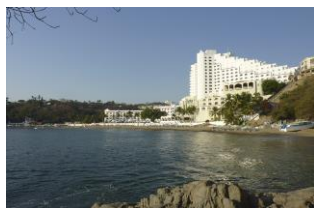
Playa La Audiencia