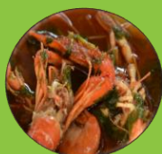
Chigüilines & chacales