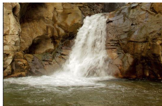
Take a dive in El Salto waterfall