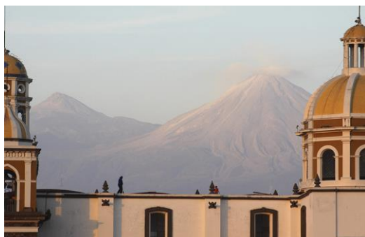
Tour the magical town of Comala