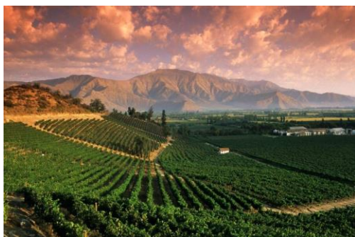
Discover the oldest winery in the Americas, Casa Madero

Dominated by the desert, many of the attractions of Coahuila are in this ecosystem, although some, such as the Cuatro Ciénegas Biosphere Reserve are a surprising find. With about 150 different species of plants and animals endemic from the valley and mountains and because of its fragile and unique ecosystem, the valley is a perfect environment for photography lovers.