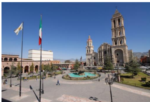
Walk around Plaza de Armas in Saltillo