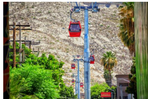
Ride the cable car in Torreón