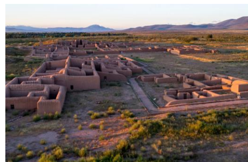
Visit the archaeological site of Paquimé