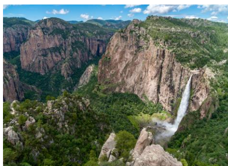
Experience the wonders of the Basaseachic falls