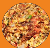
Machaca with eggs