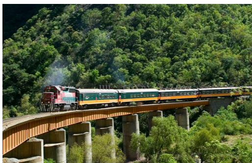
Travel more than 200 miles in "El Chepe" train

In Chihuahua, the Madre Occidental mountain range is displayed with all its grandeur through the mountains, plateaus, amazing rivers, streams, pine forests, waterfalls, caves and of course, the Copper Canyon, one of the largest and most impressive canyon systems in the world, where rocky cliffs and vertical walls 1,500 meters show the broadest and deepest canyons in the country.