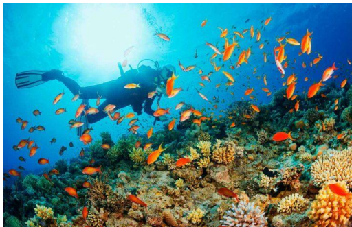
Dive into the magical waters of La Paz