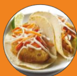
Baja fish tacos