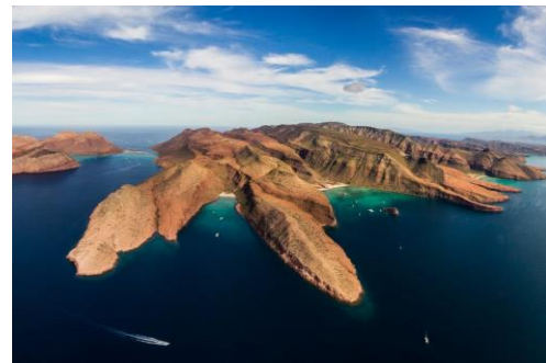
Explore the Espiritu Santo Island, a UNESCO World Natural Heritage Site