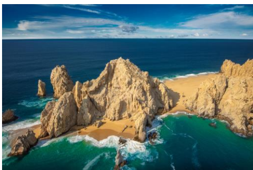
Fall in love at Lovers Beach

Baja California Sur is the paradise for lovers of sports and wildlife, its climate is an earthly paradise for surfers and allows games of golf all year round, boat trips to the island Espiritu Santo for whale watching and swimming with sea lions. Its pristine beaches are excellent for water sports and also in Cabo Plumo, you can go diving in coral reefs.