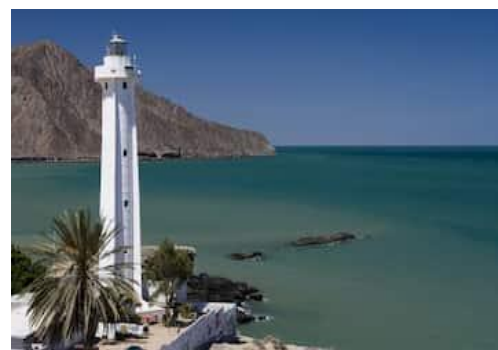
Relax in the beach of San Felipe