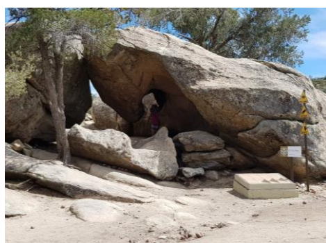
Visit El Vallecito archaeological site