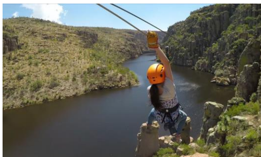
Experience the thrill of Boca de Tunel Adventure Park

Aguascalientes is a state rich in history, culture, tradition and nature, it is part of the Bajío area, bordering Zacatecas to the north and Jalisco to the south. It owes its name to the hot springs found in the region. Its territory has a wide variety of experiences for everyone.