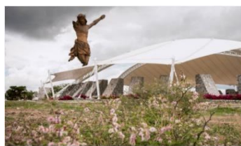
San José Gracia

"Boca de Tunel is a hidden gem, more exciting than anyone that has visited can explain. Located 45 mins from Aguascalientes, this thrilling experience alone is worth the trip from any place located within driving distance"