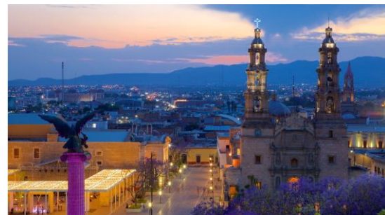
Tour the city of Aguascalientes