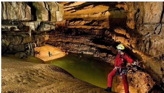
Immerse yourself in an archeological site, El Ocote