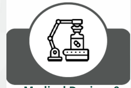
Medical Devices & Pharmaceuticals