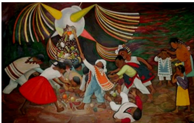
"La piñata" - Diego Rivera

The Embassy of Mexico in Austria, concurrent to Slovenia and Slovakia, wishes you a Merry Christmas and a Happy New Year 2017!