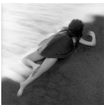
Tortuga-Azul (MX 2004)

Flor Garduno, considered one of the most important contemporary photographers in the world, was born in Mexico City in 1957. She studied at the Antigua Academia de San Carlos of the UNAM University with Kati Horna, and later for two years as darkroom assistant with Manuel Alvarez Bravo. She lives and works in Tepoztlan, Mexico. Homepage of Flor Garduño >>