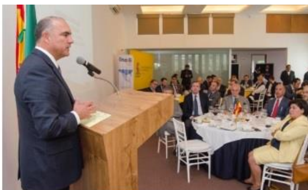
José Calzada Rovirosa, Titular de la SAGARPA