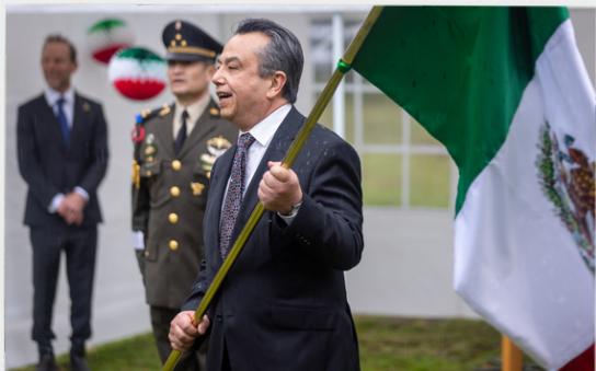
Australia 15.09 22

In his speech, the Ambassador highlighted the values of Mexican independence. He continued on to emphasize the points of agreement in the bilateral relation with Australia, including trade ties and the important contribution of the Mexican community to Australia's economy and culture. The speech concluded with the emotional Cry of Independence.