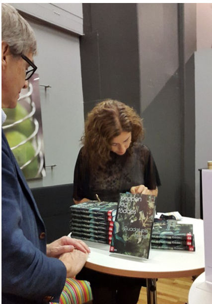
Guadalupe Nettel signing Swedish language editions of her novel.