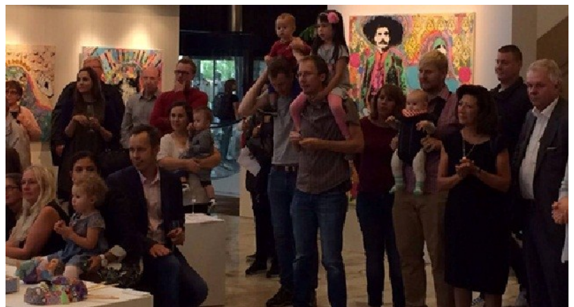
Top: Works by Swedish-Mexican artist Loana Ibarra.