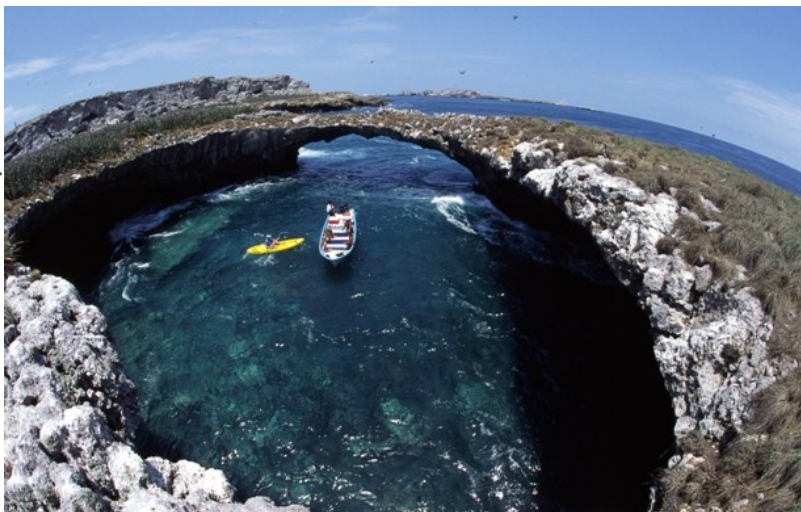
A bay in Nayarit.

Nestled on the imposing Western Sierra Madre, and washed by the waters of the Pacific Ocean, the Nayarit Riviera is rapidly becoming one of Mexico's most attractive tourist destinations. The area consists of a 192 mile stretch of coastline backed by jungle-clad mountains and facing off-shore islands. There is plenty of remote backcountry for those looking to explore a more rustic side of rural Mexico.