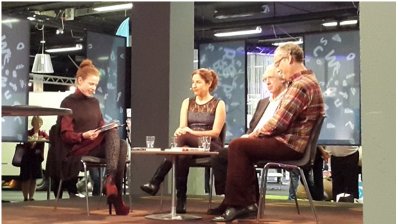
Recording of the Swedish TV show "Babel" with Jessika Gedin, with guests Guadalupe Nettel, Ian McEwan and Jonas Jonasson.