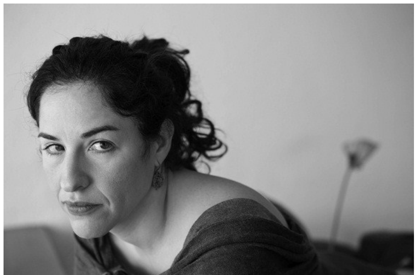
Author Guadalupe Nettel.