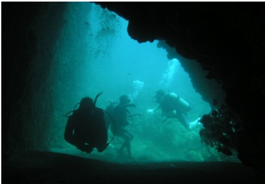
Top: Divers in Nayarit.

The Huichol Indians are the most famous ethnic group in the region. They are characterized by their eye-catching clothing, hats adorned with feathers and their colorful handcrafts, such as masks and animal figurines made of beads, pictures, purses and jewelry.