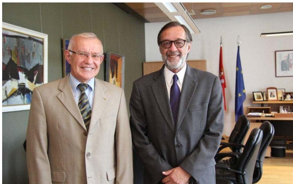
Vice Minister of Lithuania Neris Germanis and Ambassador Gasca Pliego.

During this visit, Ambassador Gasca Pliego met with Vice Minister Germanas and with the Ambassador of Lithuania in Sweden, Eitvydas Bajarunas, to discuss potential opportunities for growth and cooperation in the bilateral relationship between the two countries.