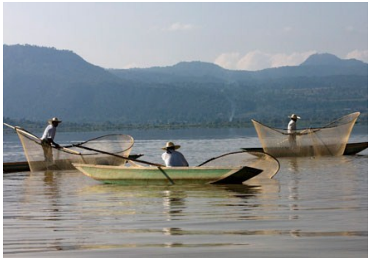
Traditional fishing with nets in Michoacán.

In short, a trip to Michoacán is a visit to a rich and fantastical land, full of traditions and life, which will surely provide unforgettable experiences at every turn.