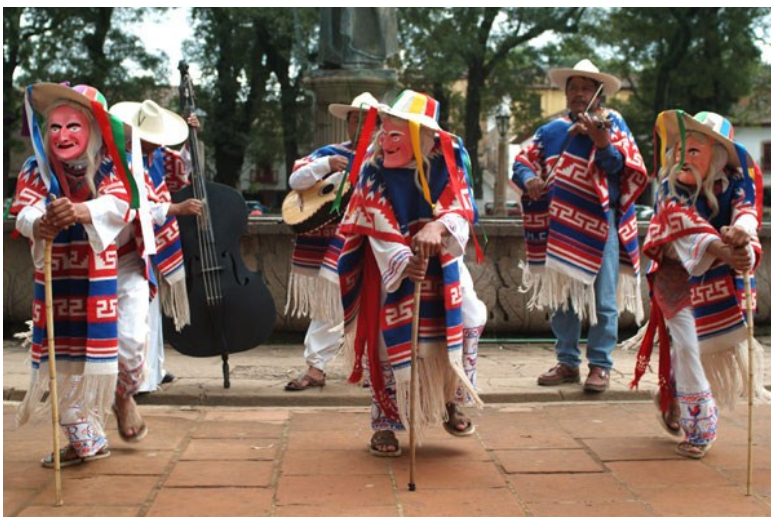
Traditional folkloric dance "Danza de los viejitos" (Dance of the Old Ones).

Text credit: www.visitmexico.com