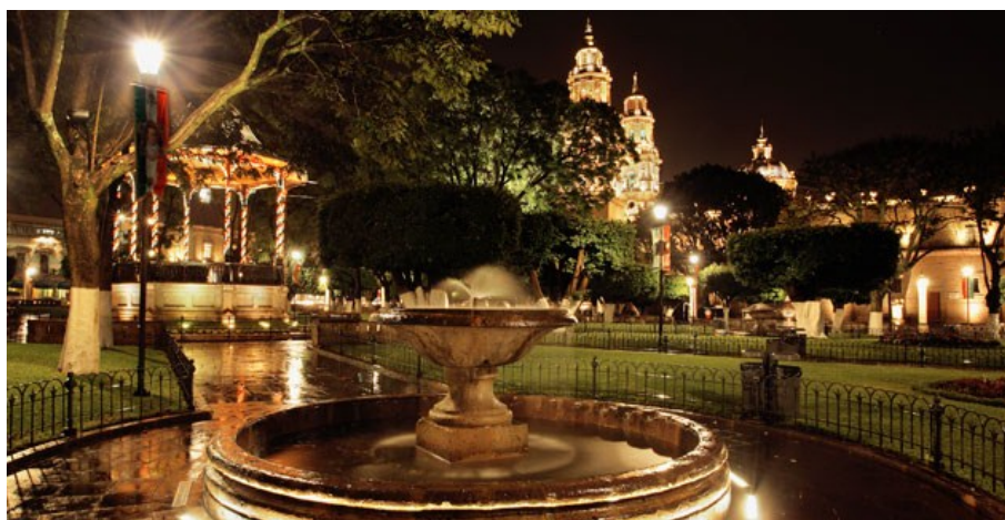
Top: Morelia's historical centre.

Cradle of amazing ancient civilizations, such as the Purépecha Empire, which have greatly