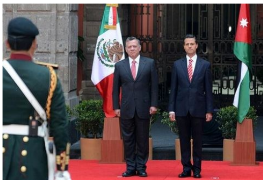
King Abdullah II of Jordan with President Enrique Peña Nieto during the monarch's visit to Mexico.

Mexico's Secretary of Foreign Affairs, José Antonio Meade, made a working tour to the Persian Gulf countries (Saudi Arabia, Qatar, Kuwait and the United Arab Emirates) in March of this year in order to strengthen political and economic ties. The foreign minister also visited Jordan in July as a follow up to the agreements reached during King Abdullah II's visit to Mexico.