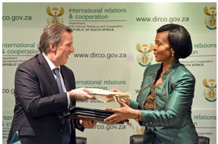
Mexico's Secretary of Foreign Affairs José Antonio Meade and International Relations and Cooperation Minister Maite Nkoana-Mashabane of South Africa.

Mexico is aware of the promising future of Africa and works to achieve a closer relationship with these countries in order to enhance cooperation, trade, and investment with them.