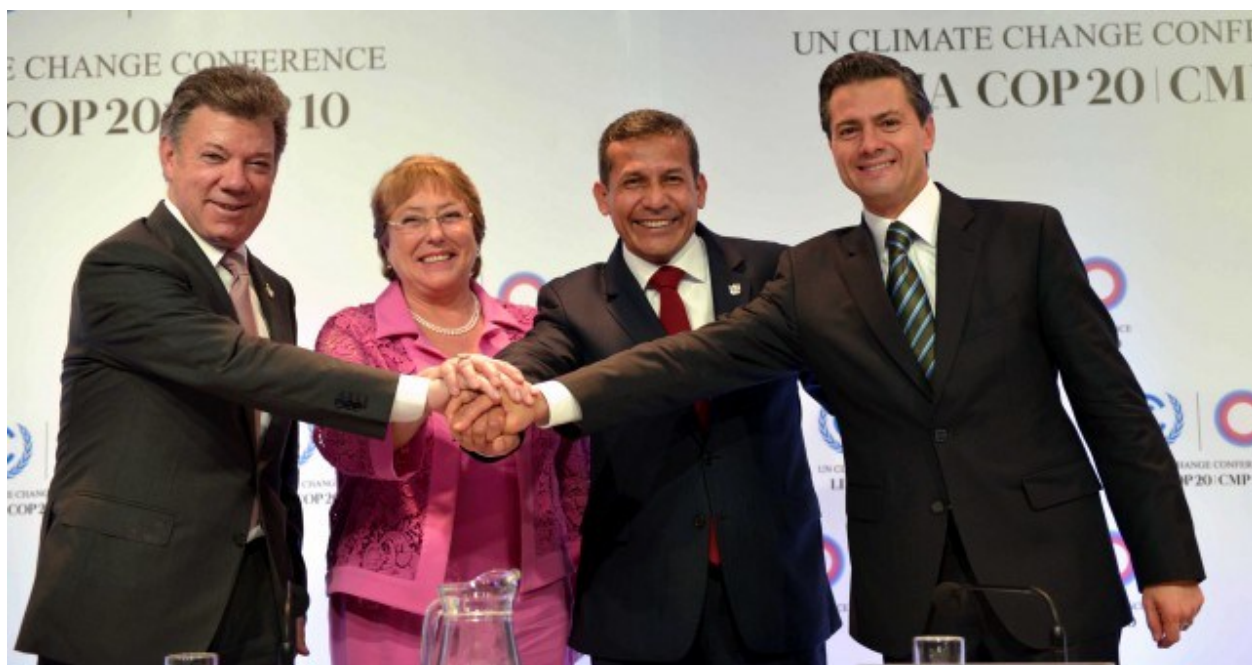
From left to right: President of Colombia, Juan Manuel Santos; President of Chile, Michelle Bachelet; President of Peru, Ollanta Humala; and President of Mexico, Enrique Peña Nieto.

The President also mentioned that, with a view to the future, “in Chile, Colombia, Peru, and Mexico we promote sustainable development that simultaneously maintains growth, social inclusion and environmental preservation policies.”