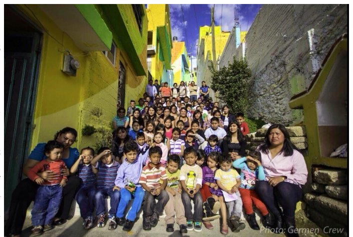
Community participants in the creation of the mural.

The project began in 2014 with the goal of reducing the risk factors associated to violence and crime that put the community of Palmitas—particularly young people—in vulnerable conditions.