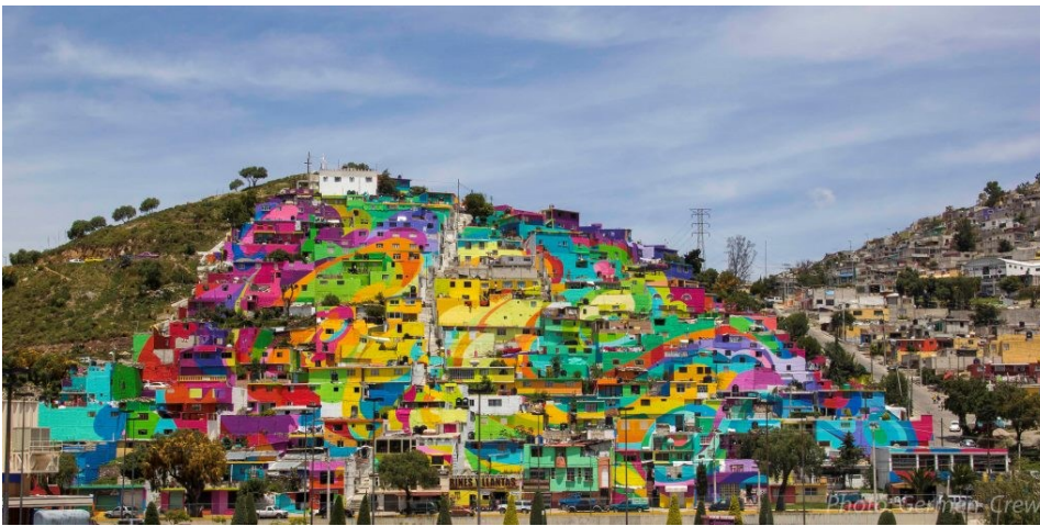
View of the Pachuca Mural.

The National Program for the Social Prevention of Violence and Crime invested five million Pesos in the creation of what has become an emblematic site: the country’s largest mural. Now, the neighborhood of Palmitas, in Pachuca, in the state of Hidalgo, not only hosts the country’s largest and most colorful mural, but is also part of a comprehensive prevention project that has resulted in the reduction of violence in the community.