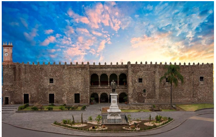
Cortés Palace, Cuernavaca.

This territory was historically dominated by the Chichimecas, but the Xochimilca and the Tlahuica people also formed settlements in the area. The latter would be the founders of Cuauhnáhuac, which the Spaniards renamed Cuernavaca, now famously known as the "City of Eternal Spring" for its wonderful weather. Cuernavaca would be the town chosen by Hernán Cortés to establish an extensive fiefdom. The area's temperate climate also made it ideal for the creation of several sugarcane estates, and the Jesuits established temples