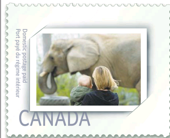
Image of one of the stamp templates, which are designed to look like picture frames.

Canada Post app lets you create personalized stamps from uploaded smartphone snapshots. We try the look with photos from today's Star